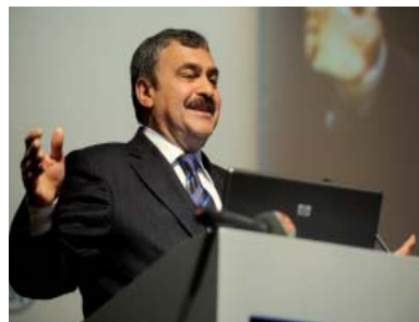
Veysel Eroğlu, Minister of Environment and Forestry, Turkey

Süleyman Demirel, former President, Turkey, stressed that human beings have an obligation to protect the earth through better water management practices, emphasizing that “water is the centre of the universe.” Affirming that potable water is scarce, he noted that population growth could exacerbate the plight of millions of people without access to safe drinking water and proper sanitation. He highlighted the importance of dams for economic growth and social advancement.