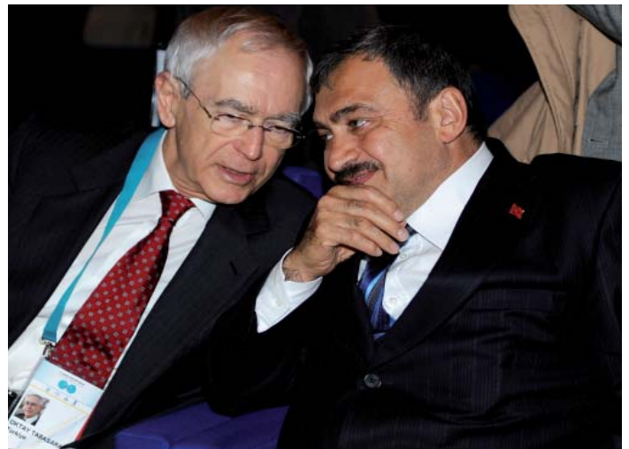
L-R: Oktay Tabasaran, Secretary General, World Water Forum, and Veysel Eroğlu, Minister of Environment and Forestry, Turkey