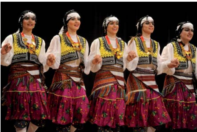
Local dancers entertained delegates throughout the day