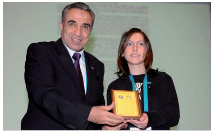
One of the winners showing her award during the Turkey Day Technical Session Awards and Reception

within the basin and the surrounding area has led to the melting of snow and subsequent rise in water levels in the basin. He said these will necessitate the construction of large water-storage facilities.