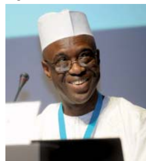
Bai-Maas Taal, Executive Secretary, AMCOW

AFRICA: Bai-Maas Taal, Executive Secretary, Africa Ministers' Council on Water (AMCOW), said the meeting would serve as a launching pad for the Africa Regional Paper and aimed to mobilize broad regional and international