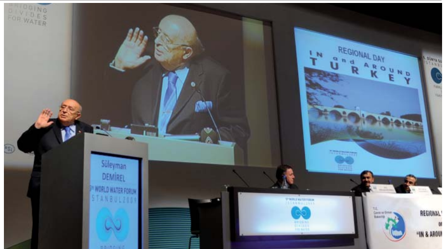
Süleyman Demirel, former President, Turkey, addressed Forum participants at the session on the region “In and Around Turkey”.

The 5th World Water Forum continued on Wednesday, 18 March in Istanbul, Turkey. Participants attended regional presentations on Africa and the sub-region “In and Around Turkey.” Parliamentarians met throughout the day to prepare their output as part of the political process. Participants also attended thematic sessions and side events, while the Water Fair and Expo continued at the Forum’s two venues.