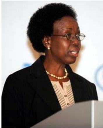
Rhoda Tumusiime , Commissioner, Rural Economy and Agriculture, African Union Commission (AUC)