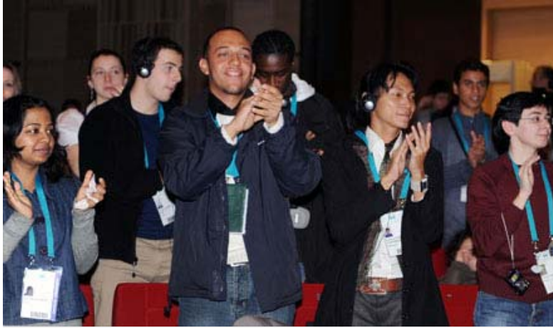
Youth delegates during the closing ceremony