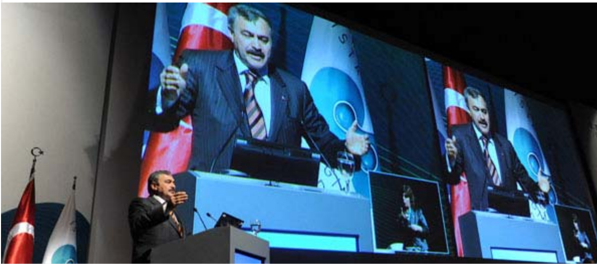
Veysel Eroglu , Minister for Environment and Forestry, Turkey