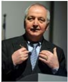
Klaus Töpfer, former UNEP Executive Director