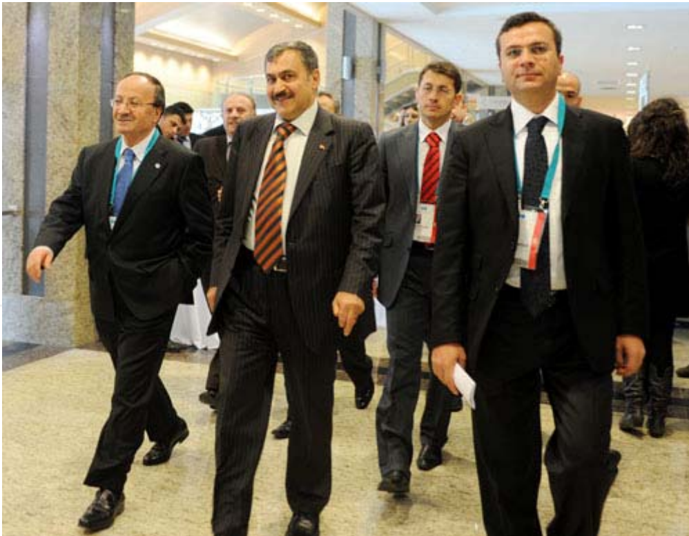
Mehmet Mehdi Eker , Minister of Agriculture and Rural Affairs, Turkey, at the end of the Ministerial Conference Closing