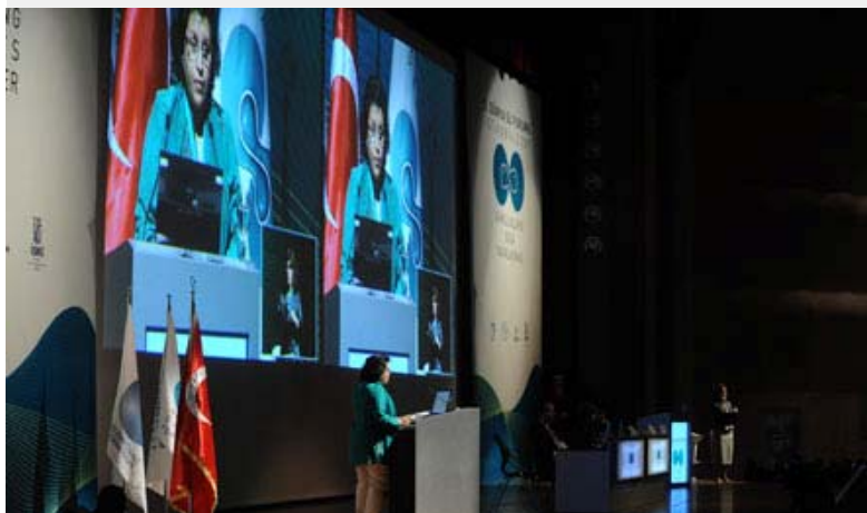
A representative of the Gender and Water Alliance argued that “the Ministerial Declaration seems to go back in time”