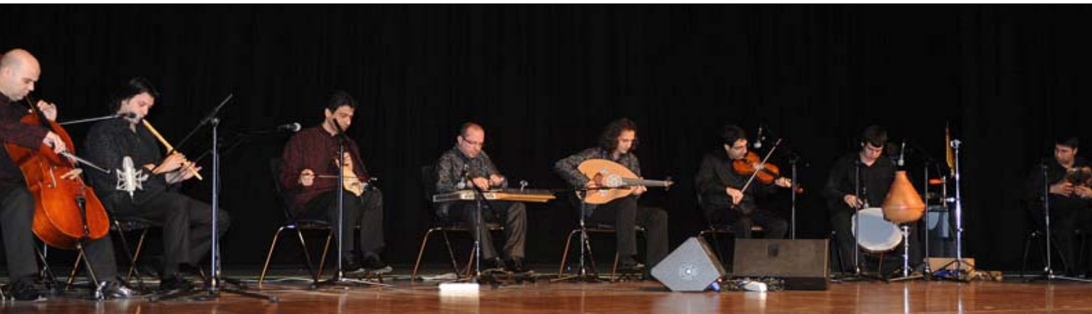
Musicians performed during the closing ceremony