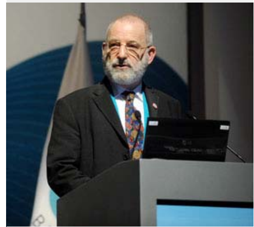
A representative of Business Action for Water said that: water is critical for business, and business for the economy and employment