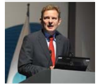
Ger Bergkamp , Director General, World Water Council