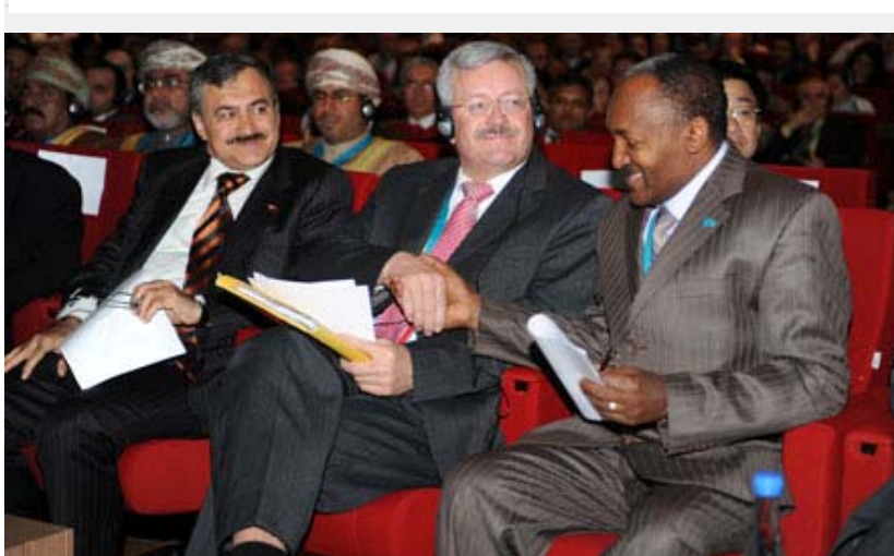
Delegates prior to the start of the conference