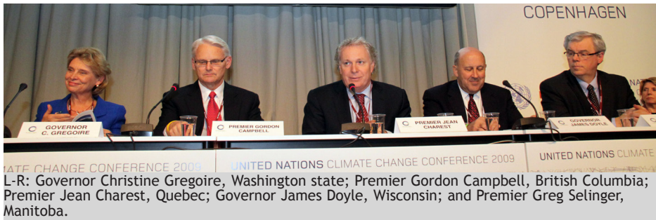
L-R: Governor Christine Gregoire, Washington state; Premier Gordon Campbell, British Columbia; Premier Jean Charest, Quebec; Governor James Doyle, Wisconsin; and Premier Greg Selinger, Manitoba.

Presented by The Climate Registry (TCR) and Georgetown Climate Center