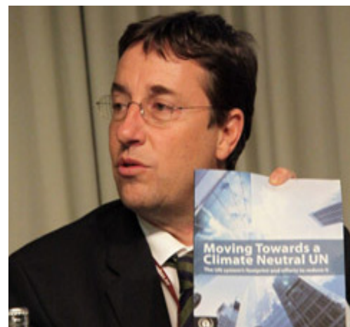
Achim Steiner, UNEP, stated that while some people liken working towards the carbon neutrality to "scaling the Himalayas," in fact carbon neutrality is already being achieved at the local level.