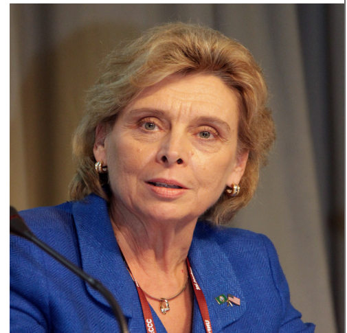
Governor Christine Gregoire, Washington state, highlighted various state-level policies in Washington state, including: statutory targets; tax incentives; and clean energy standards.

Premier Greg Selinger, Manitoba, noted the importance of hydropower in achieving emission reduction goals in Manitoba, and emphasized the involvement of first nations as “equity stakeholders” in dam projects. Noting energy efficiency plans that incorporate low-income programming that engages inner city people, he pointed to resulting social justice and energy benefits. He also highlighted a coal tax that is due to come into place in 2011 and recent increases in Boreal protected areas.