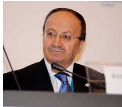
Hasan Sarikaya , Undersecretary, Ministry of Environment and Forestry, Turkey