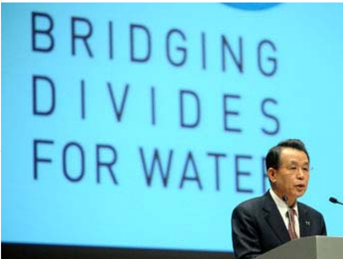
Han Seung-soo , Prime Minister, Republic of Korea