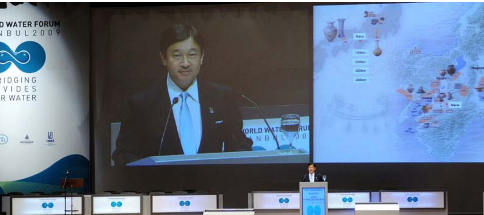
Naruhito , Crown Prince of Japan, welcomed the action plan on water and disaster.