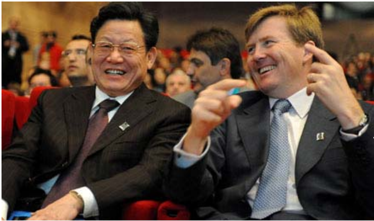
L-R: UN Under-Secretary-General Sha Zukang ; and Prince of Orange Willem-Alexander of the Netherlands