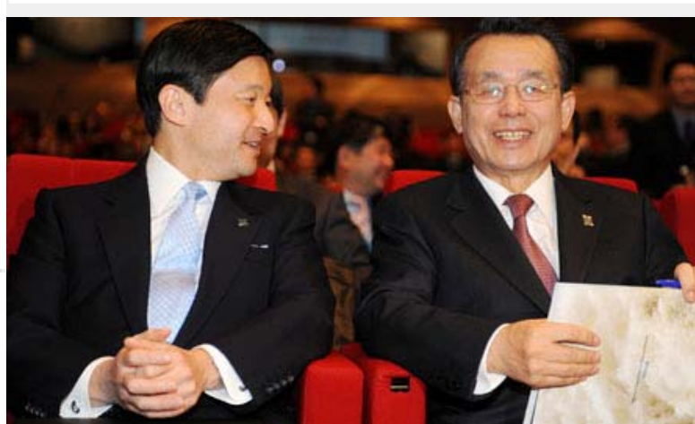
L-R: Naruhito , Crown Prince of Japan, and Han Seung-soo , Prime Minister, Republic of Korea