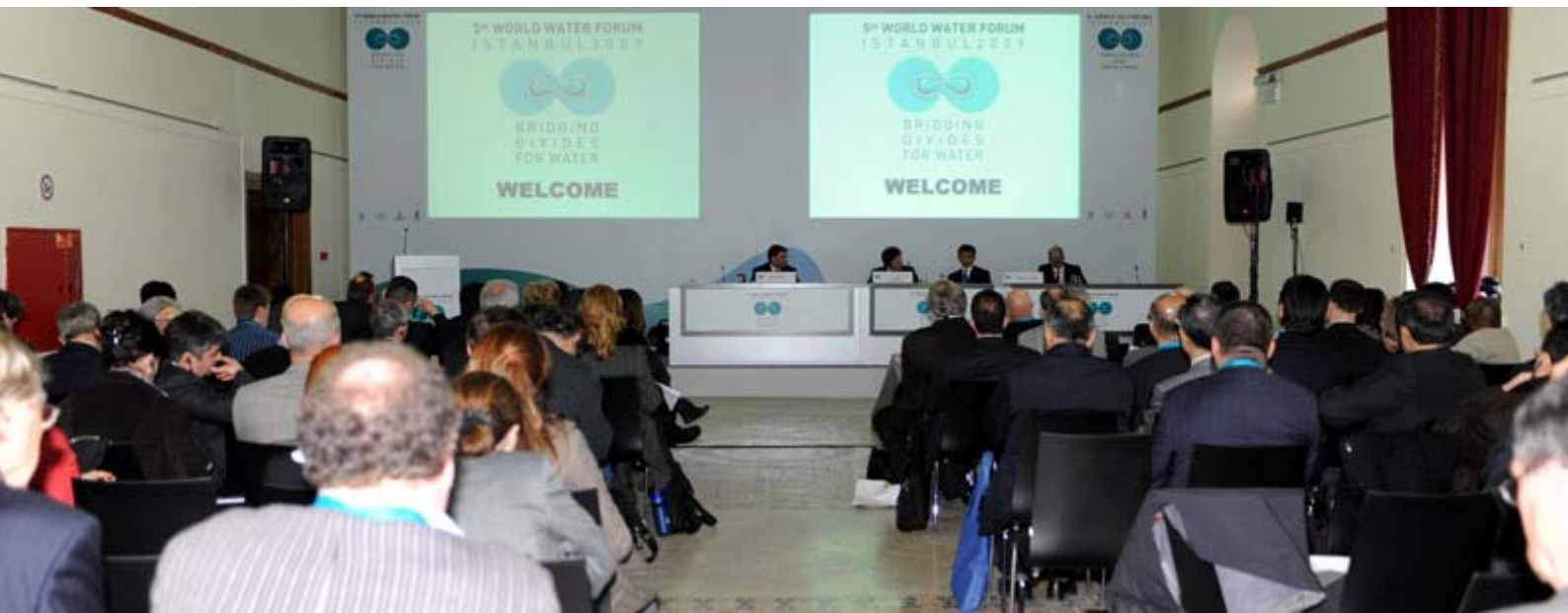
Participants during the event