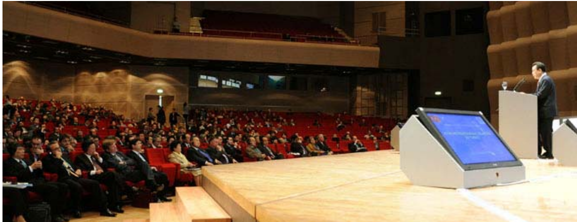
Han Seung-soo , Prime Minister, Republic of Korea, highlighted the need to increase global resilience