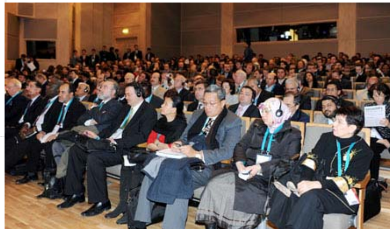
Delegates during the meeting