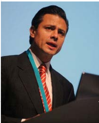
State of Mexico Governor Enrique Peña Nieto said innovative approaches are needed to address the growing burden of recharging and transporting water.