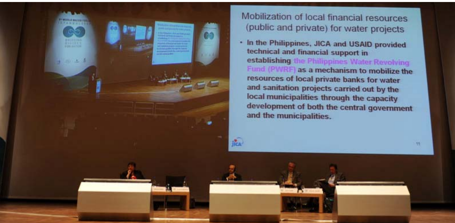
The dais during the discussion.