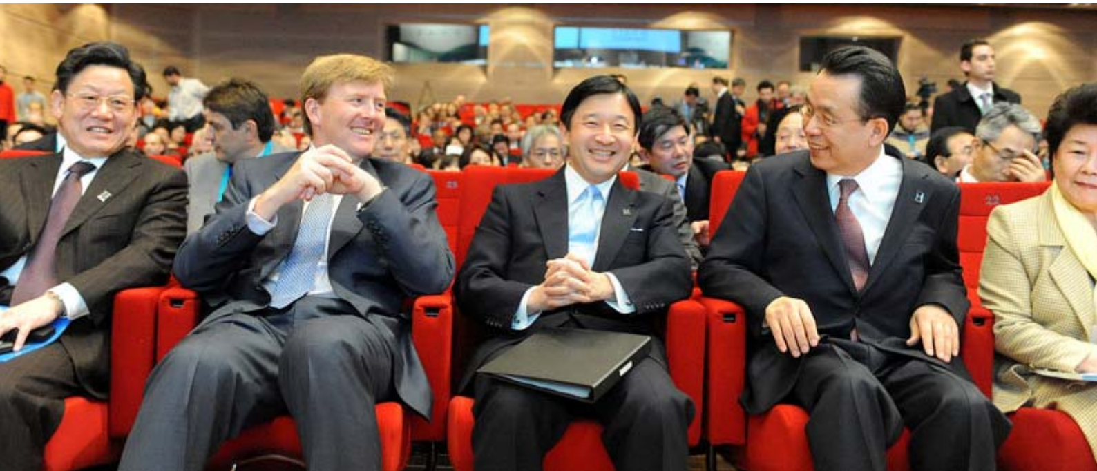
L-R: UN Under-Secretary-General Sha Zukang ; Prince of Orange Willem-Alexander of the Netherlands; Naruhito , Crown Prince of Japan; Han Seung-soo , Prime Minister, Republic of Korea; and Hong Soja , his wife