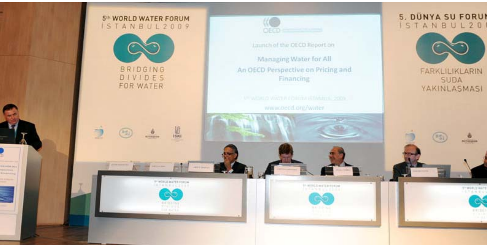
The dais during the launch of the OECD Report