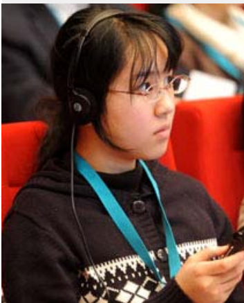
Little girl listening to Han Seung-soo's speech