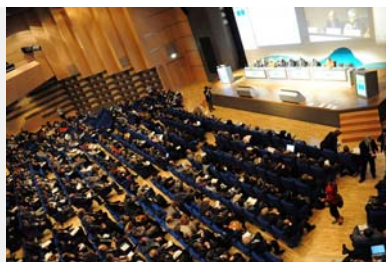
A bird's eye view of the session