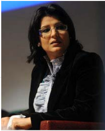
Mona El-Shazli , Egypt TV