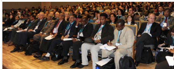
Delegates during the session