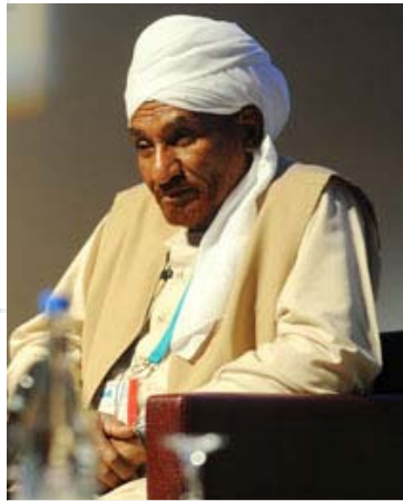
Al Sadiq Almahdi , Former Prime Minister, Sudan