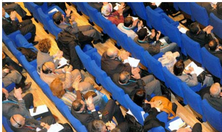
Participants during the session