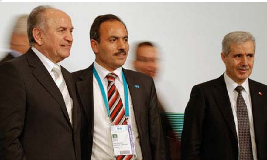
The Mayor of Istanbul, Kadir Topbaş (right), with a participant from the local authorities forum