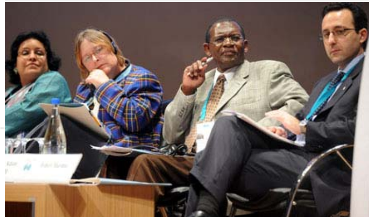
Panelists during the thematic wrap-up