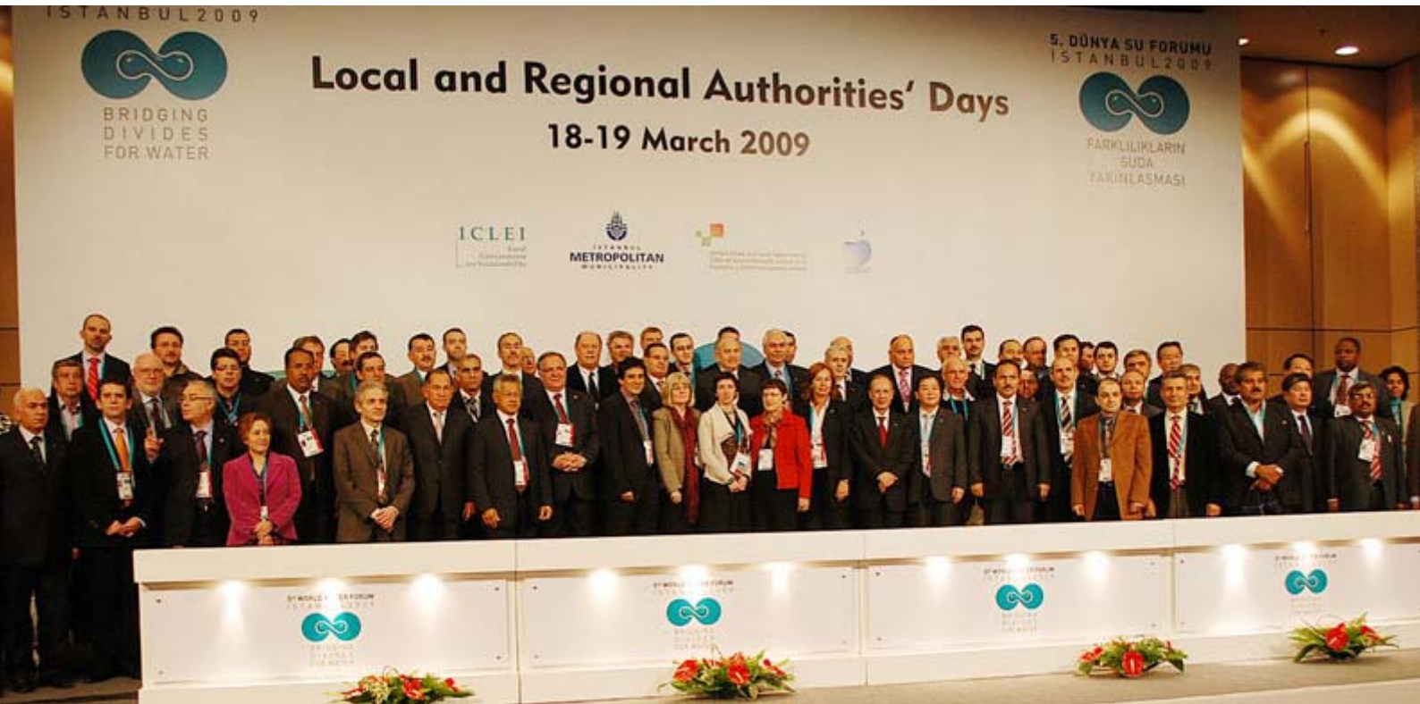
Participants of the Local Authorities session posed for a photograph