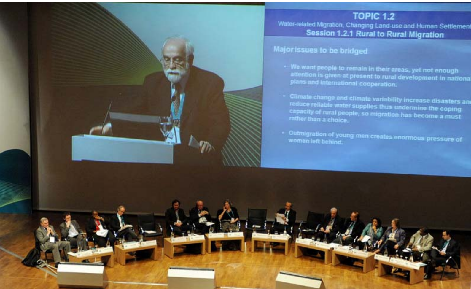
Delegates during the wrap-up session