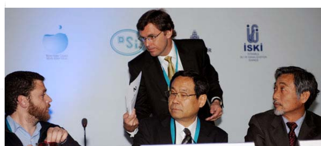
Members of the panel talking before the session