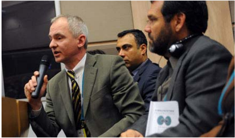
Participants engaged in an interactive dialogue with panelists