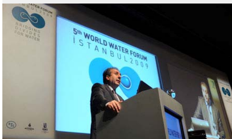
Mehmet Mehdi Eker , Minister of Agriculture and Rural Affairs, Turkey