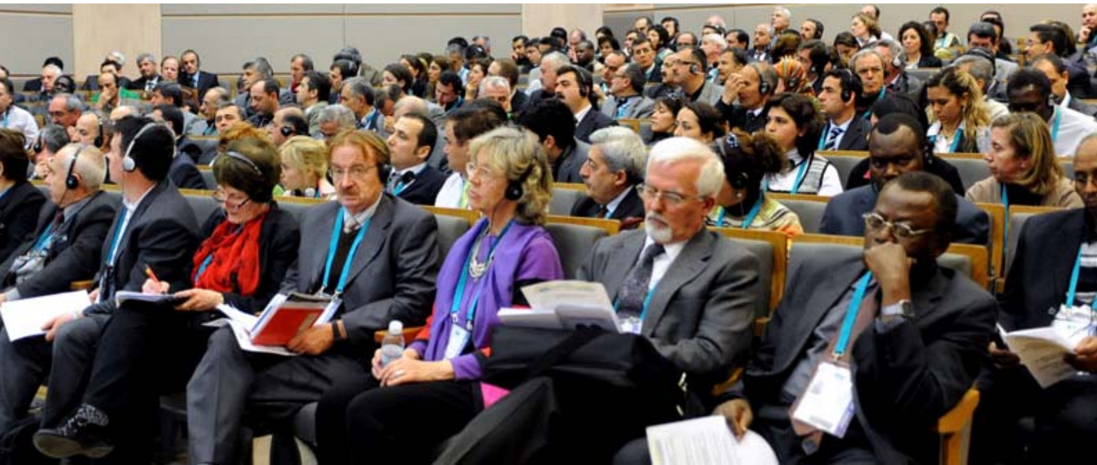
Participants during the session