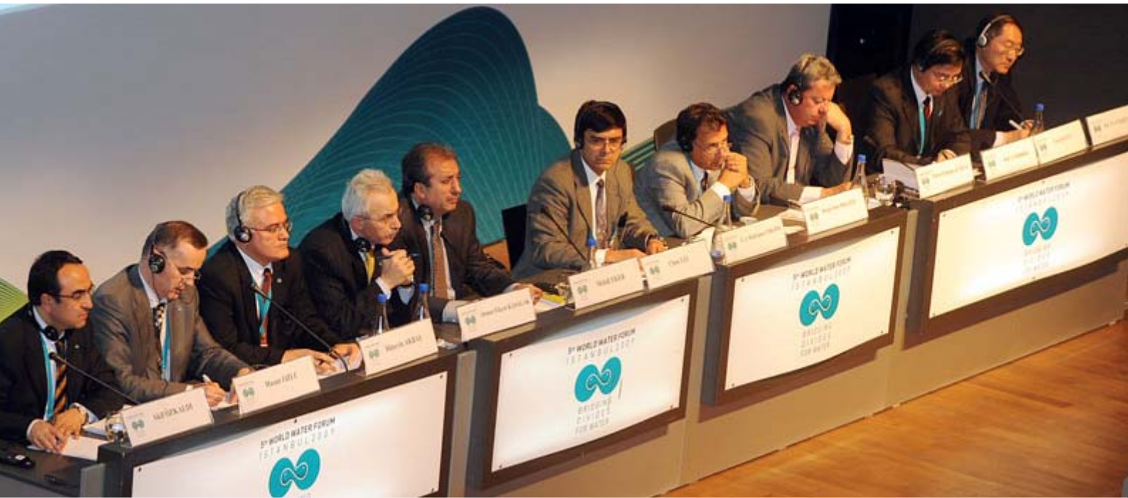
A view of the dais during the plenary discussion