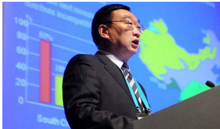
Chen Lei , Minister of Water Resources, China