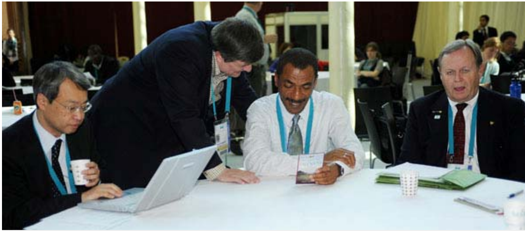
Participants during the session