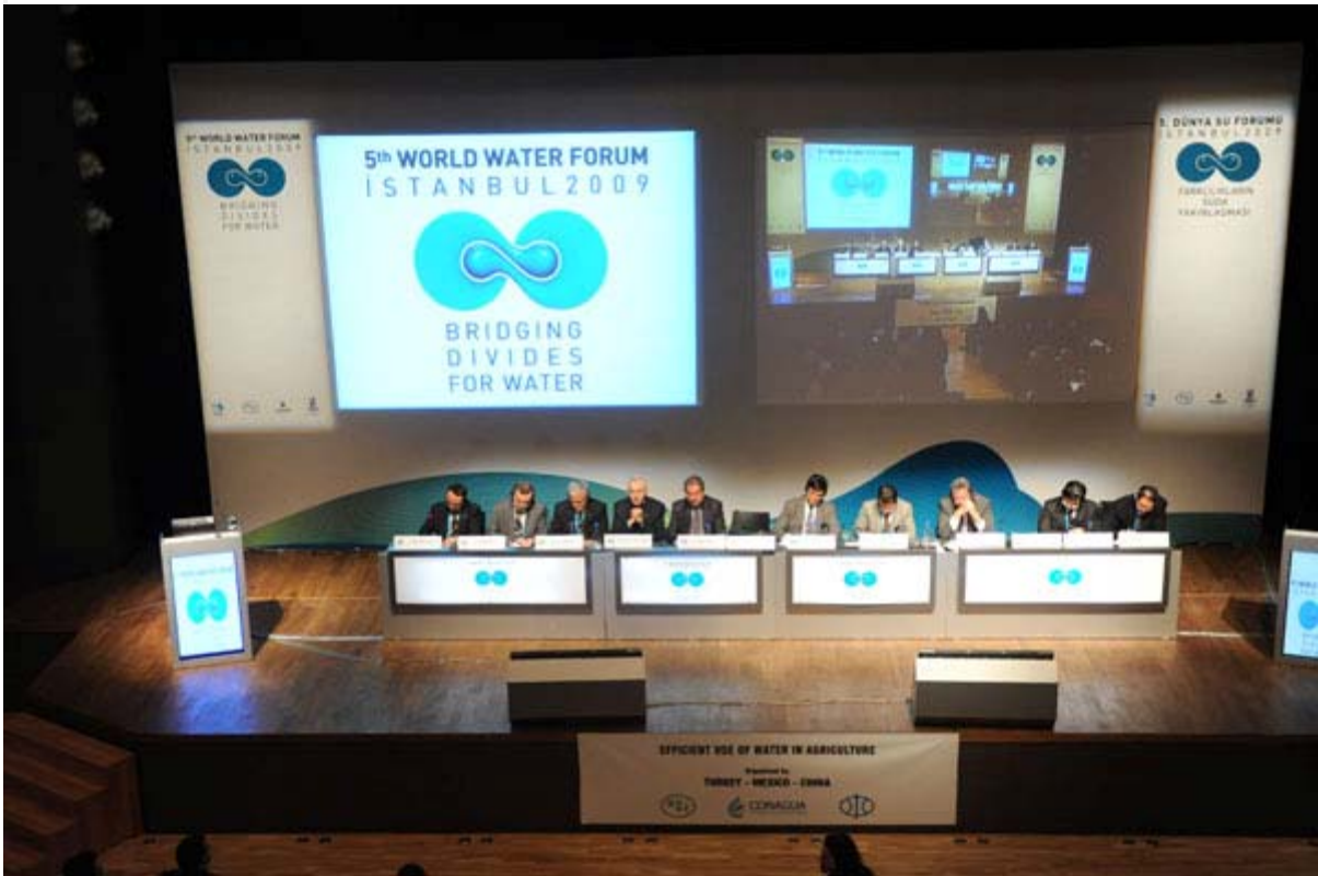
The dais during the session