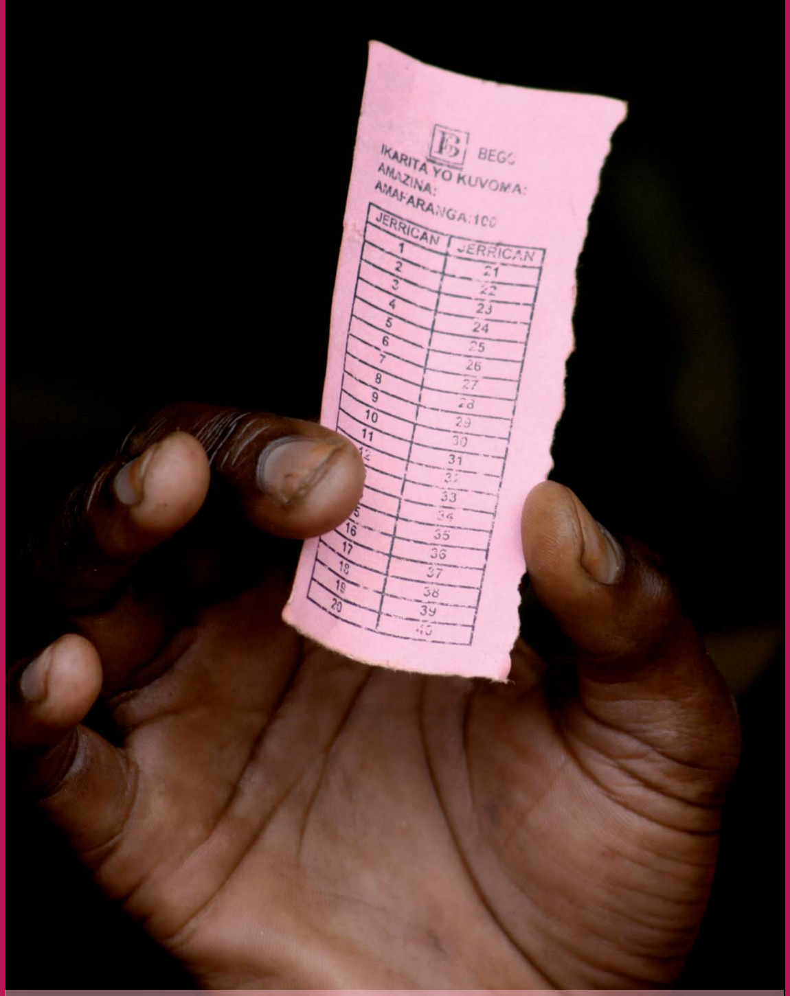
This card is used in rural Rwanda for the sale of water. A box is ticked for the sale of each jerrican.